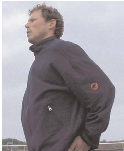
Hidden under coat.