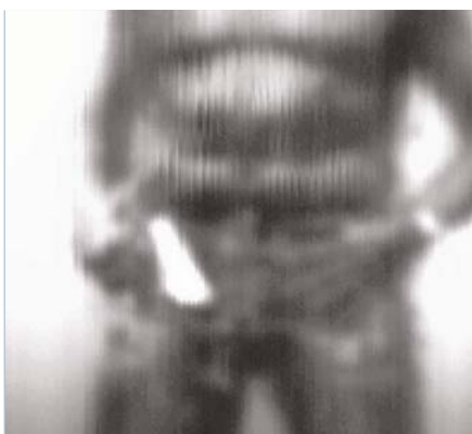
The mm-wave image reveals.