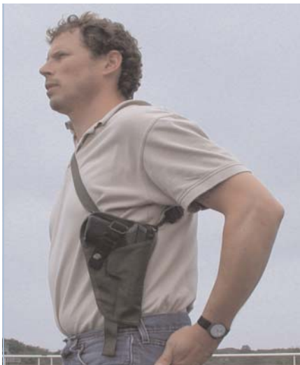
Weapon in holster.

In present-day society the detection of concealed weapons or explosive material rapidly becomes more important. There is a trend towards the prevention of carrying weapons by people in every day life. At the one hand this is due to the increase of violence in everyday life, on the other hand it is caused by the possibility of terrorist attacks.