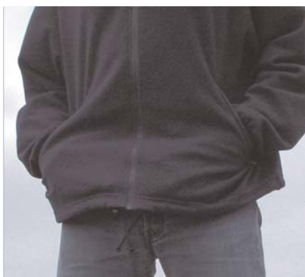
Weapon hidden under coat.

The concealed weapon detector shown in these images works at 94 GHz and is mechanically scanned in order to sense all points in a scene. Its patent pending antenna, especially designed for this purpose at TNO, only receives data from a specific point in space at which the device is directed, so the scanning is needed in order to obtain a complete image. No post processing is needed, the images can be formed instantly on a computer screen, simply by plotting the pixels obtained from the radiometer. The result of some measurements with the TNO system can be found in the images at these pages. They clearly indicate the capabilities.